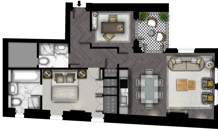
FIRST FLOOR MEZZANINE

APPROX. GROSS INTERNAL AREA * 730 Ft 2 - 67.82 M 2